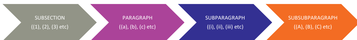
Figure 1 Breakdown of a section

Usually, legislation has more than 1 section. Groups of sections can be organised into parts. Parts may be broken into divisions and subdivisions, and chapters may be used for particularly large and complex legislation. The following figure shows the hierarchy of groupings of provisions: