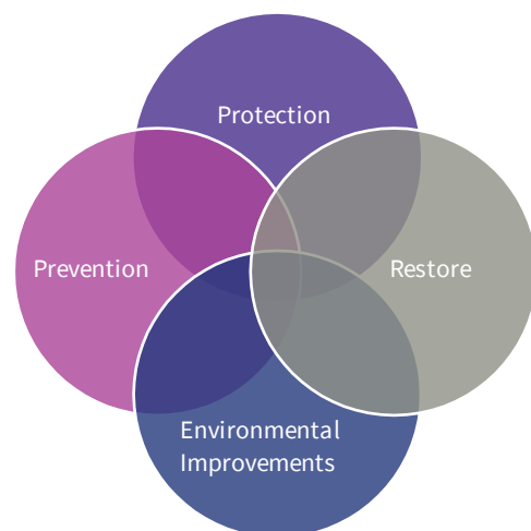
The relationship between our Strategic Objectives

Restore – require businesses engaging in polluting activities to make progressive environmental improvements and/or undertake environmental restoration. This includes establishing a process for polluters to assess and, where appropriate, remediate land where contamination is causing or is likely to cause a significant risk of harm to human health or the environment.