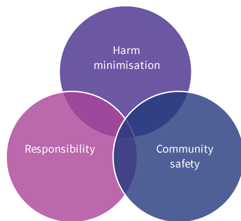
Figure 1 - The relationship between our Strategic Objectives

Responsibility – the Act encourages responsible attitudes and practices towards the sale, supply, promotion and consumption of liquor.